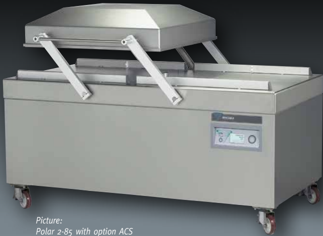
Picture: Polar 2-85 with option ACS